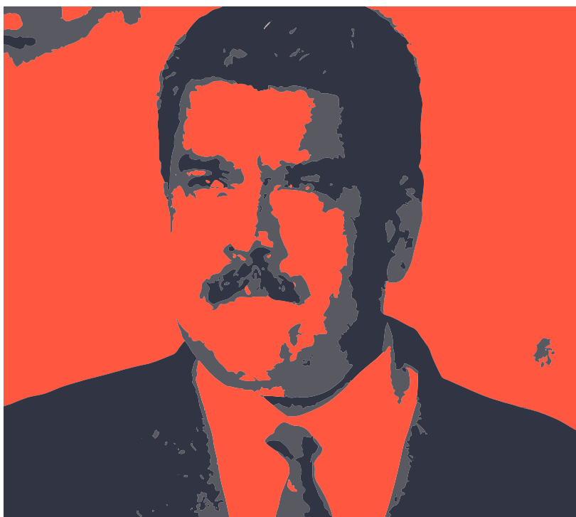
Nicholas Maduro has posed a similar threat to the democratic institutions of Venezuela.

sides diminished any serious probability of passing an even moderate response against the Maduro regime. Thus, human rights violations were necessary, but not sufficient, for OAS members to consider the situation in a member state (Venezuela 2014) and take action (e.g., a PC resolution).