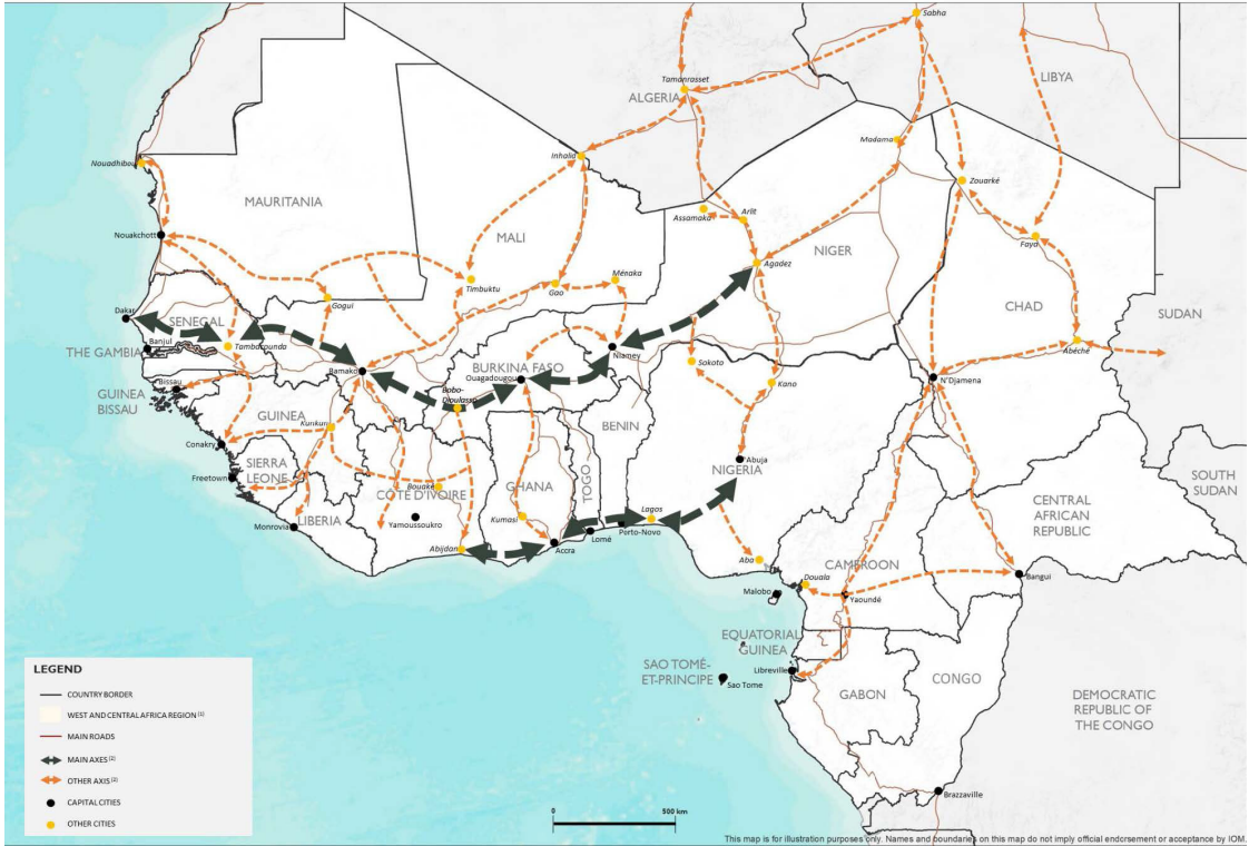
Figure 2: Migration Flows in the Sahel (2018) (IOM)